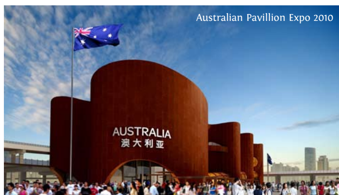
Australian Pavilion Expo 2010